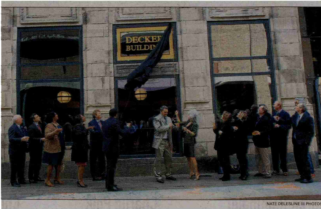
Local elected and business and economic development leaders formally unveil the historic facade of the Decker Building, which will be incorporated into The Main, a soon-to-open hotel and conference center in downtown Norfolk.